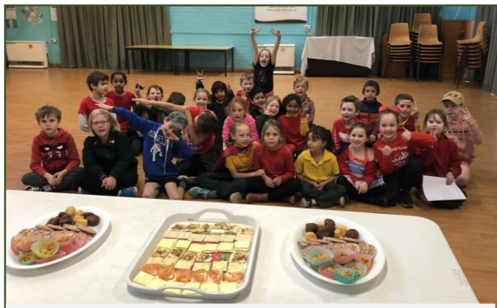
Good Effort Afternoon tea held 3/7/19